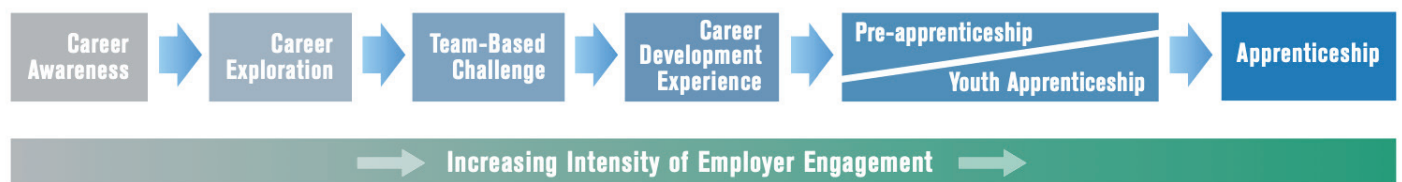
Figure 1 – The continuum of employer engagement and work-based learning. As intensity of employer engagement increases, student becomes more immersed in the workplace environment.

Work-based learning is defined in Perkins V legislation as “sustained interactions with industry or community professionals in real workplace settings, to the extent practicable, or simulated environments at an educational institution that foster in-depth, firsthand engagement with the tasks required in a given career field, that are aligned to curriculum and instruction.” It is an effective teaching strategy used to engage students in real-life, authentic occupational experiences. It incorporates structured, work-based learning activities into the curriculum, allowing a student to apply knowledge and skills learned in class and connect these learning experiences in the workplace (see Figure 2). Work-based learning provides students with the opportunity to engage and interact with industry experts (employers, postsecondary institutions), while learning to demonstrate essential employability and technical skills necessary for today's workforce.