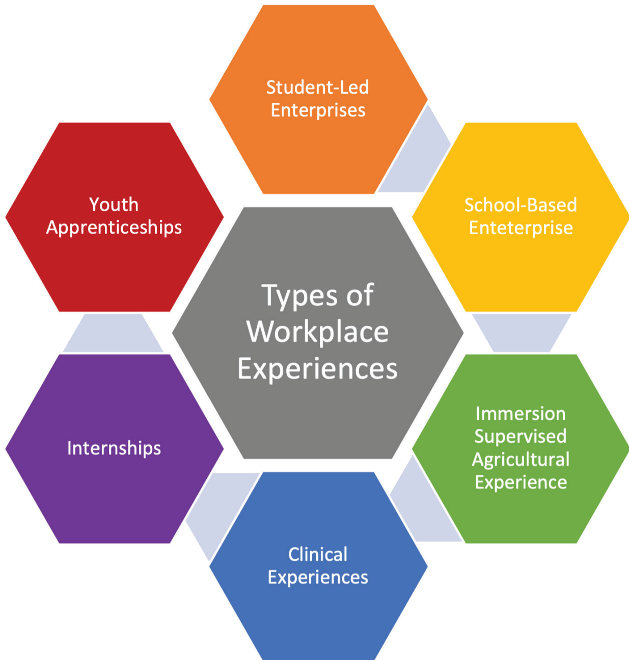
Figure 3 Types of Workplace Experiences